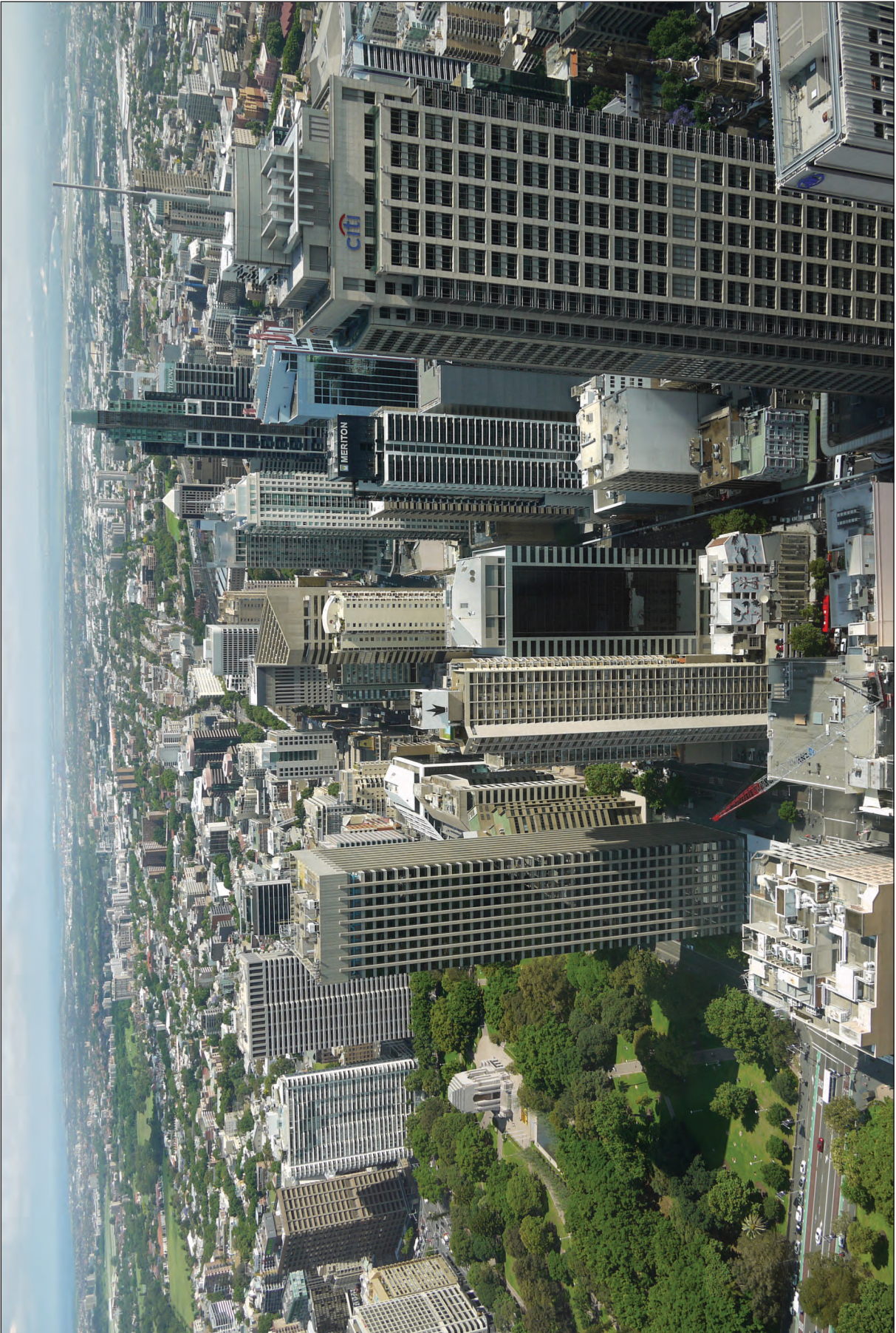
Figure 2: Photograph showing part of a city